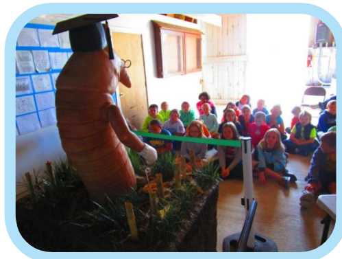
S.K. Worm gives a demonstration to 4th grade students.

S.K. Worm is the pride and joy of Erie Basin. An impressive, museum-quality, animatronic worm that interacts with kids through song and movement, this annelid (or worm) educates children on the importance of soil as a natural resource.