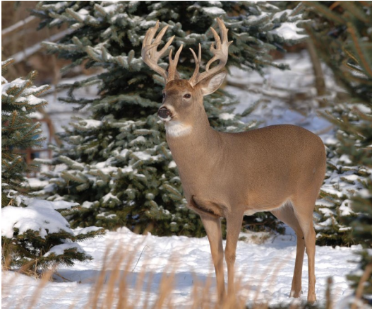
White Tailed Deer