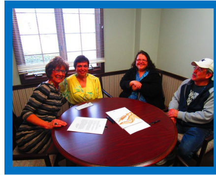
Local credit helps job creation.

Visit the project's website for more information! https://www.ohwildlife.org